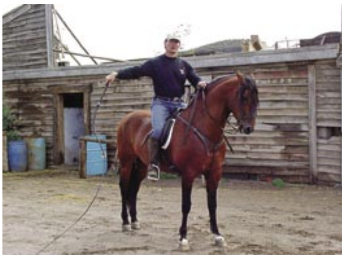
Training Andalusian stallion “Chico” for The Queen of Swords .