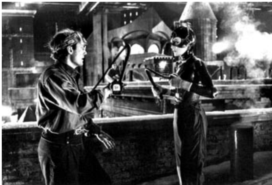
Coaching Michelle Pfeiffer as Catwoman on the rooftops.

I trained and choreographed Michelle Pfeiffer with the bullwhip for her role as Catwoman in Batman Returns . As you might well imagine, there are few places more unfavorable to accurately throwing a whip than a crowded movie set interior. We wanted to create a new style for Michelle that would reflect the complexity of her character: alluring, hypnotic and sensual,