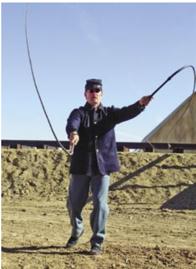
Practicing double whips on the set of Into the West .